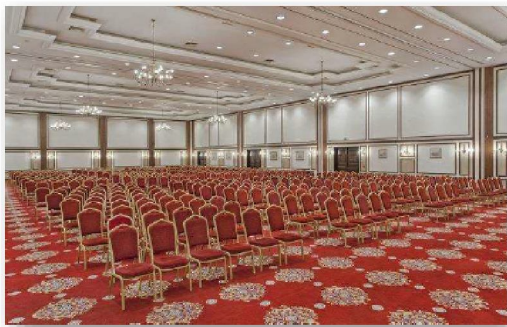
Conference Centre and Exhibition halls for herbal fair/EXPO