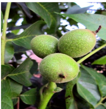
Juglans regia L.