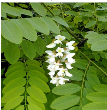
Robinia pseudoacacia L.