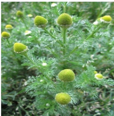
Cotula anthemoides L.