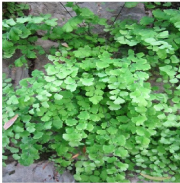
Adiantum capillus-veneris L.