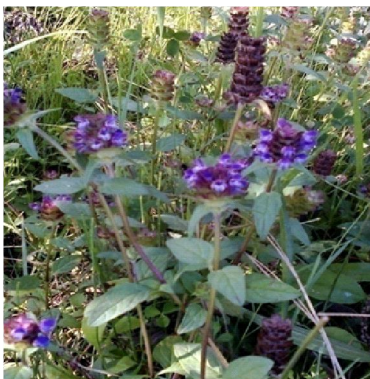
Prunella vulgaris L.