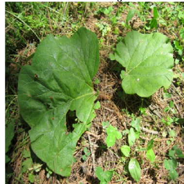
Rheum emodi Wall