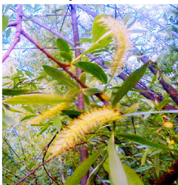
Salix acmophylla Boiss