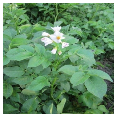
Solanum tuberosum L.