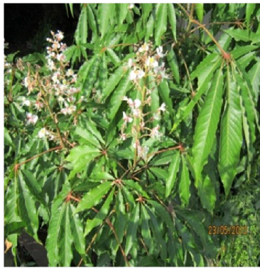
Aesculus indica Colebr.ex.Wall