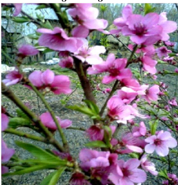
Prunus persica (L.) Batsch