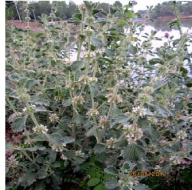
Marrubium vulgare L.