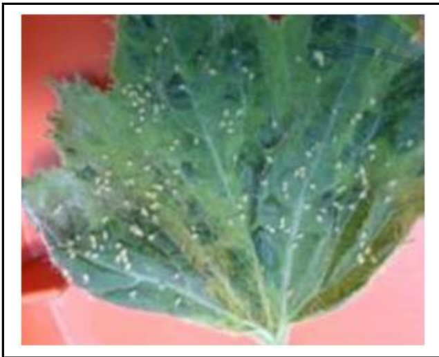
Figure 2: Acquisition feeding period of aphids.